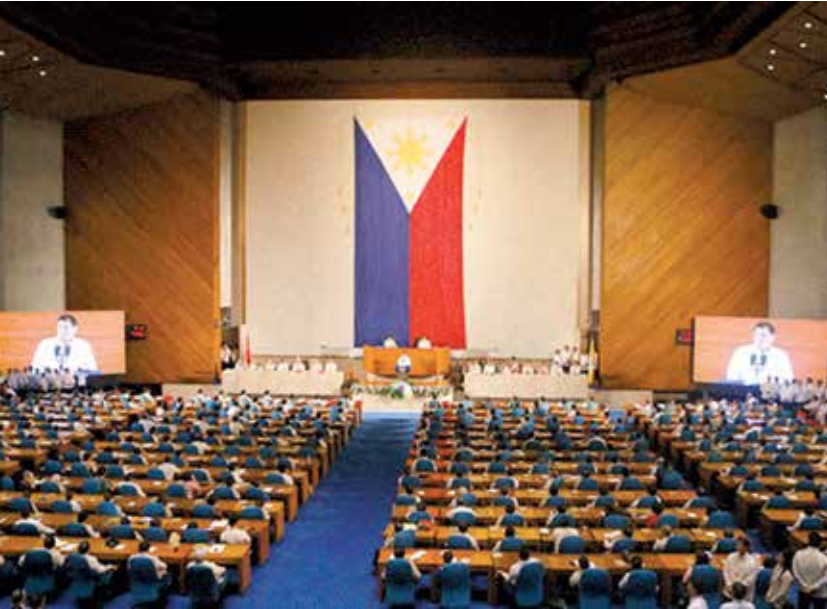
President Duterte holds a speech at the House of Representatives

Aside from human rights defenders and civic organizations, Duterte's government also systematically attacks oppositional politicians. In particular, the imprisonment of Senator Leila de Lima, one of Duterte's most vociferous domestic political critics, drew widespread attention internationally. While de Lima is presently the only imprisoned member of congress (see Case: Leila de Lima), the government and its supporters have tried to silence a considerable number of other politicians from both parliamentary chambers by besieging them with legal charges.