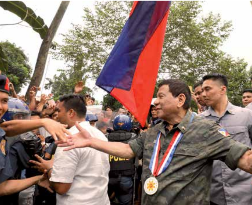
President Duterte interacts with supporters

Following the peaceful ousting of the dictator Ferdinand Marcos in 1968, the Philippines was seen as a trailblazer of democratic development in Asia for many years. Now, however, the idea of universal human rights is under severe pressure there. In July 2016, Rodrigo Duterte took office as the President of the Philippines, vowing explicitly to kill many thousands of alleged drug criminals. Today, halfway through his six-year term of office, it is clear that this promise has become a terrible reality. What is more, even beyond the so-called war on drugs, Duterte has literally declared anybody who opposes him and his politics to be fair game. The present report shows that the rhetoric of violence propagated by the President has led to a human rights disaster even worse than the precarious situation under his predecessors.