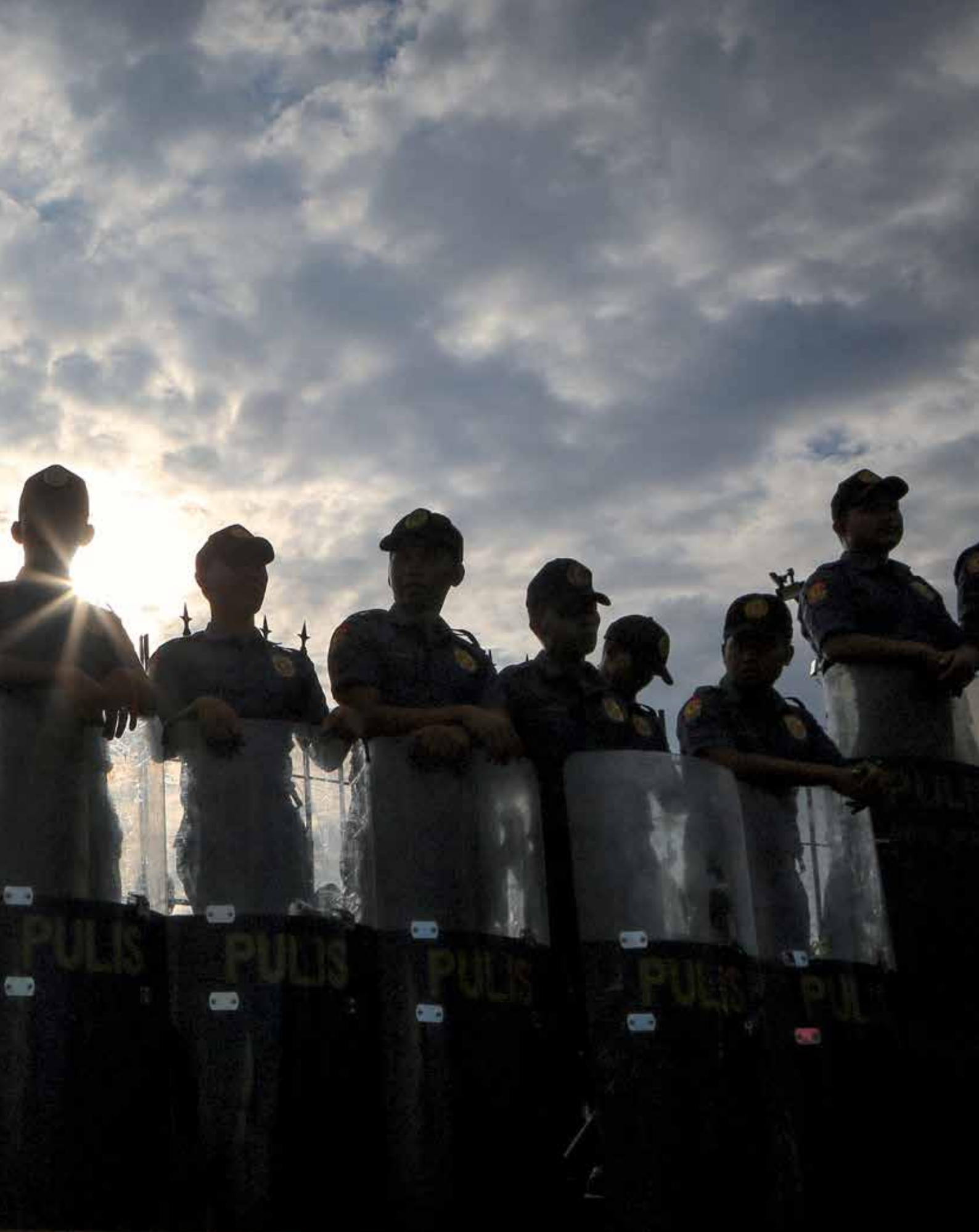
Philippine National Police on September 21, 2018, during the 46th Anniversary of Martial Law in Luneta, Manila