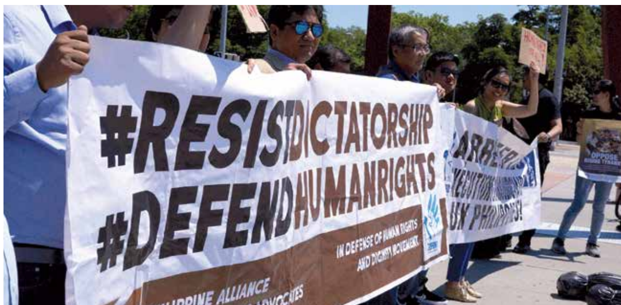
Philippine human rights activists protest at the UN in Geneva

the war on drugs. 82 Despite the withdrawal, the Court remains mandated to prosecute all crimes committed before the withdrawal date. 83 Although the Philippines was elected to the UN Human Rights Council for a further two-year period in 2018, the government has staunchly refused to cooperate with the council's mechanisms. In 2017, for example, the Philippines rejected all the country-related recommendations concerning the war on drugs, extrajudicial executions, the death penalty, or protection of human rights defenders. 84 In reaction to a Human Rights Council resolution in July 2019 instructing the UN High Commissioner's Office to compile a report on the human rights situation in the Philippines, 85 several senior government representatives declared that they regarded such an investigation as illegitimate external interference and refused to cooperate with it. 86